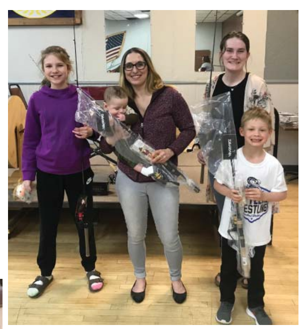
Kids receive a free fishing pole. CONGRATULATIONS!